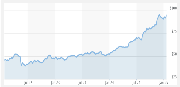
Exhibit 1: WMT Share Price, 3Years